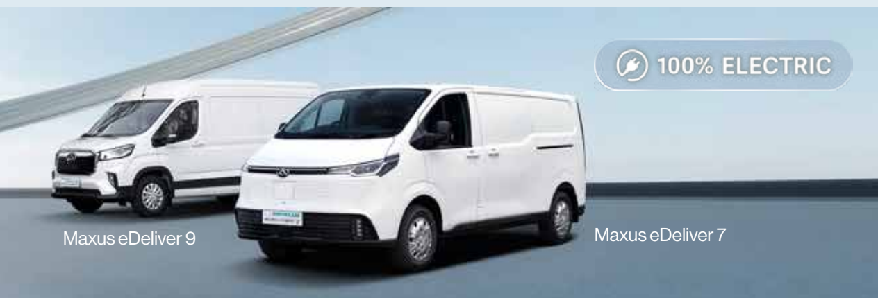
Maxus eDeliver 9