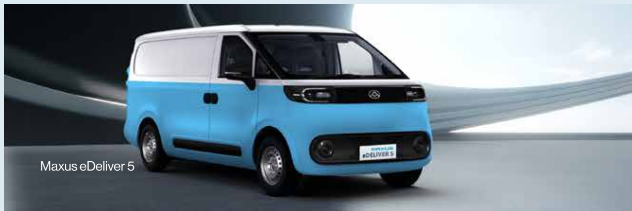
Maxus eDeliver 5